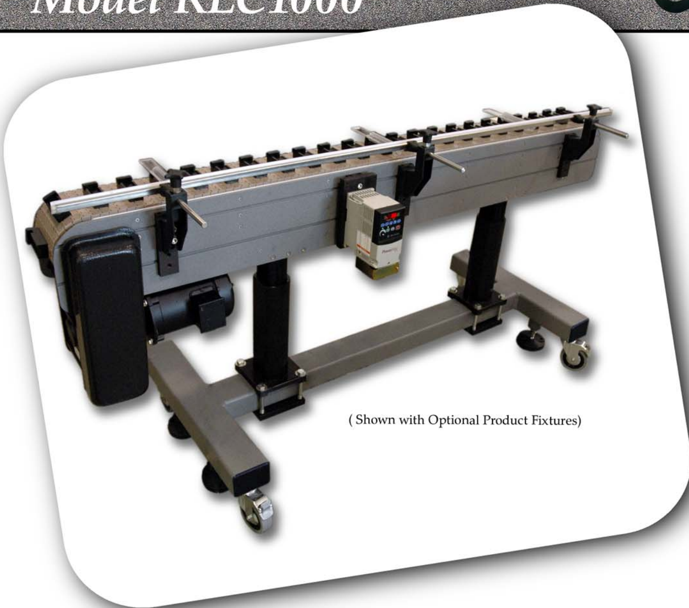
(Shown with Optional Product Fixtures)